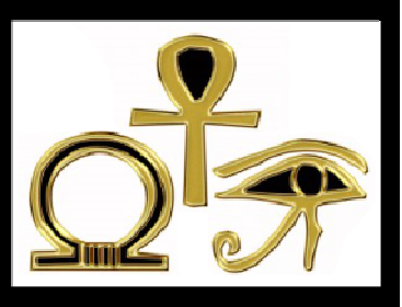
Academic Tutorial Clinics: Math -Writing - Reading