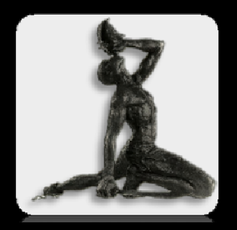
Haiti From The Bottom