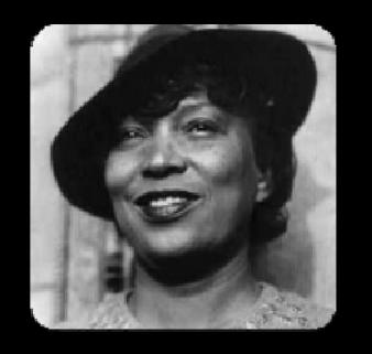
Writing About Literature