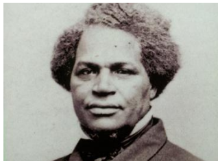
Below: Rev. Jermain Loguen